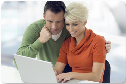
Different lifestage images can be represented here

Employees are eligible to participate in the 401(k) Plan via salary deduction the first day of the month following 90 days of service and are eligible for the “per pay-period” match after completion of 6 months of service. The Company’s matching contribution to the 401(k) Plan for 2020 is $1 for every $1 that an employee contributes to the Plan, up to a maximum of 3% of you annual base salary. The participant’s contributions, and any Company matching contribution, are 100% vested when made.